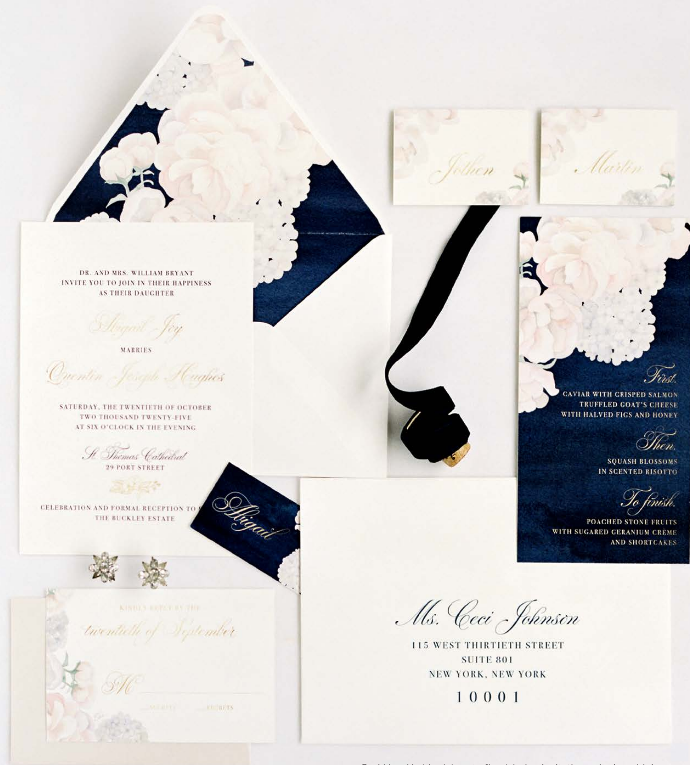
Ceci New York's elaborate floral-laden invitation suite is a shining example of the formality of an invitation and includes layers and the appropriate components of an invitation suite.

Wedding stationery will set the tone for your wedding festivities and style. The possibilities for stationery are really limitless—couples can send elaborate invitations layered in special boxes, invitations inside bottles, an invitation printed on vellum, or have their menus printed on fabric or even acrylic. Nothing is off limits when it comes to finding a personal style for your wedding stationery. This will also become a tangible piece of your wedding story that guests may hang onto forever, kept on their refrigerator or tucked safely away in a box with photographs or other keepsakes. Stowed securely away in our office, we have several boxes of stationery suites and paperie (such as boutonnière and bouquet tags, programs, and menus) from weddings and events that we created with our couples and their stationery designers.