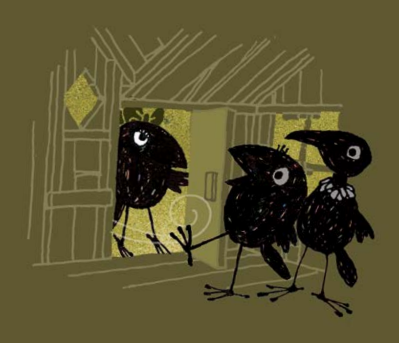
"Let me in!"