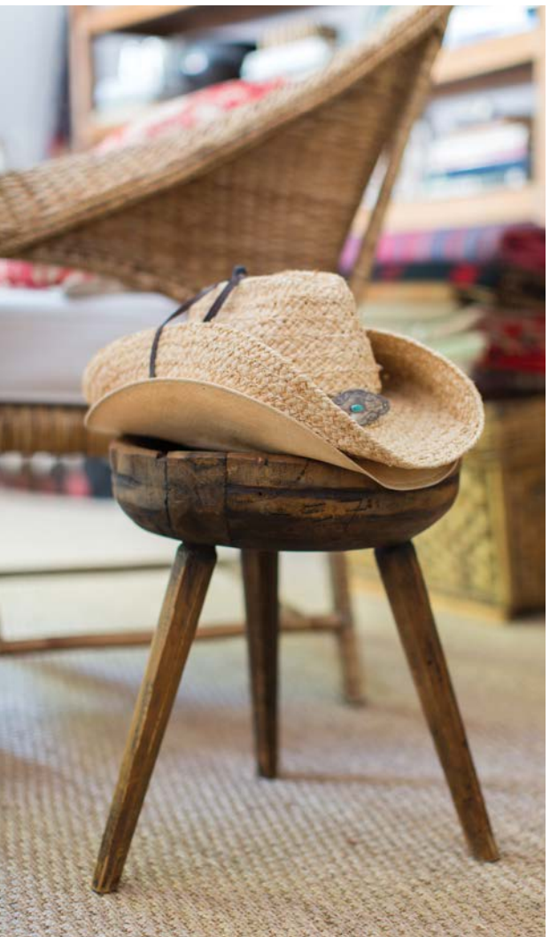
RIGHT: My cowboy hats on a small wooden stool in the den.

I always start with backgrounds first. I'm a white-wall person because I have so many accessories and fabrics that I like to keep the base clean. I decided to do sisal throughout the house this time. It doesn't show dirt, it's easy to care for and it makes the room look bigger. Whenever I do tile floors, I prefer Mexican tile or ceramic, but they can be hard on your back. So now I like wood. Lumber Liquidators will even put a foam under it, which makes it much more forgiving. I also pad under my sisal. ■