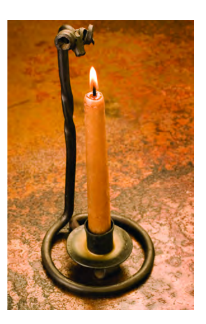
Figure 8.30. A ram head candleholder.

Take a 24-inch piece of fairly heavy walled pipe, heat, and flare one end as follows: heat the end, slip