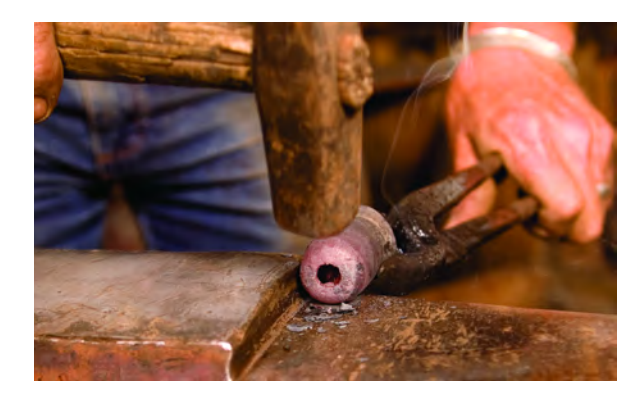
Figure 8.33. Close the base of the socket.