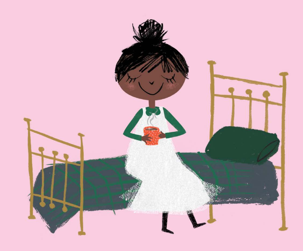
Becky is a serving girl and Sara Crewe's friend in A Little Princess.